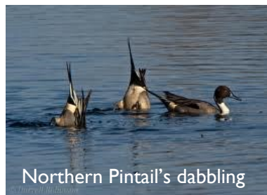
Northern Pintail's dabbling

Not all our winter feathered visitors are quite as large or flashy as swans and sapsuckers – this is also the only time of year that the impossibly tiny Winter Wren (only 4 inches), Golden-crowned Kinglet and Red-breasted Nuthatch fly south from evergreen forests to spend