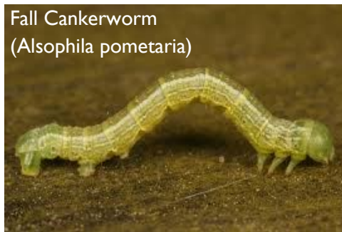
Fall Cankerworm ( Alsophila pometaria )

It is important for the Friends of Huntley Meadows Park to know that the HMP Park Manager has made the important decision not to allow this spraying to occur on Huntley Meadows Park property, due to the negative impact of this spraying